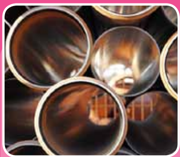
TUBE & PIPE